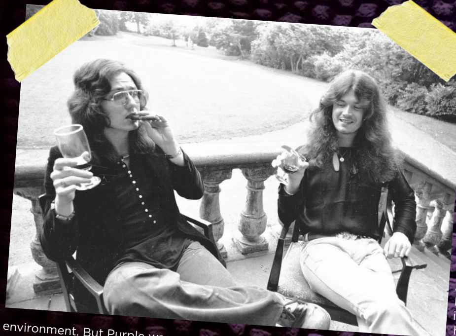
A DRINK AND A SMOKE WITH GLENN HUGHES, 23 SEPTEMBER 1973

"That's at Clearwell Castle as well, and Glenn and I are suitably rat-arsed. It's weird to think I was 22 when all this was happening. My son's just turned 22, and he's whip smart. But I meet a lot of 22 year olds now and think to myself, 'You were in Deep Purple at that age?' I was the baby of the band, so I had to mature up in terms of my abilities as a musician and a singer to be on the same level. But I always loved a challenge."