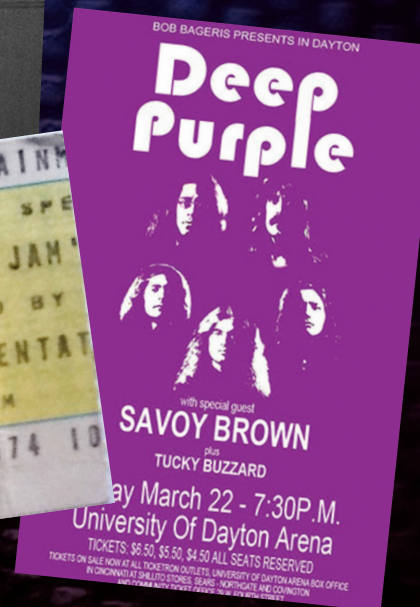
GIVING IT SOME '70S IN CALIFORNIA